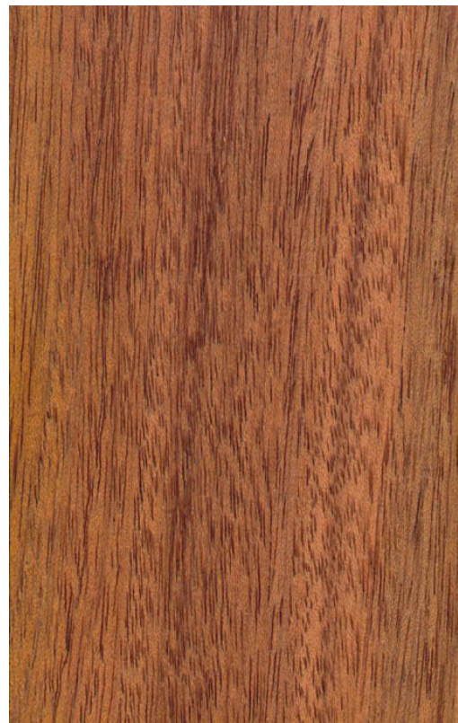
Wood surface of Mengkulang (radial section)